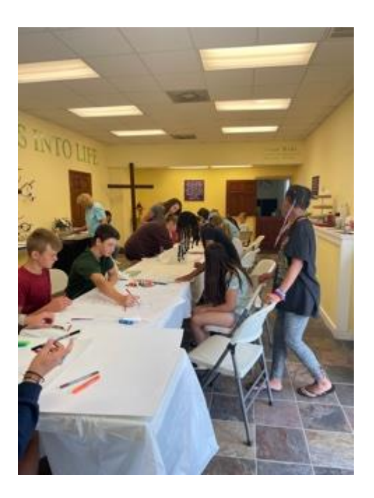
Northstar Youth working on our Angel Tree Christmas Program art work

Christmas bulbs made by some Northstar Youth